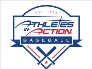
Our new AIA Baseball logo!