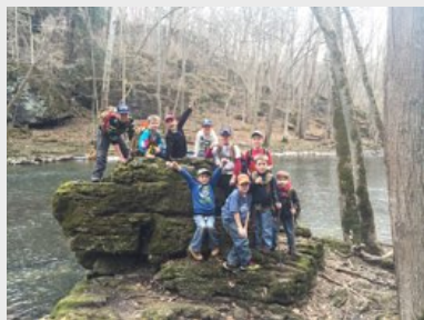
Good old fashion photo of the boys on our nature hike.