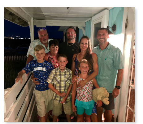
Our annual family vacation was in the Outer Banks of North Carolina!