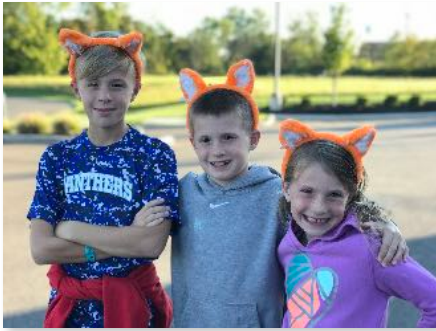
Mini Vacation: Decided to take a 2-day vacation at the nearby Great Wolf Lodge! We survived! Actually was a blast with great memories!