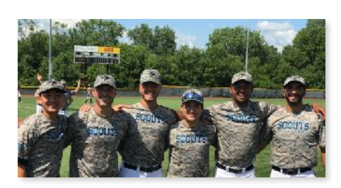
A great photo of all the minority players with our team in Xenia, OH!